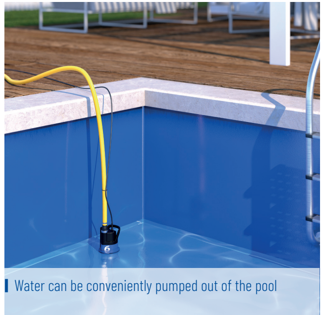
Water can be conveniently pumped out of the pool