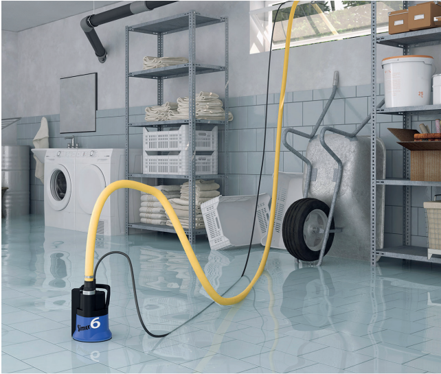
Always at hand in case of flooding in the cellar