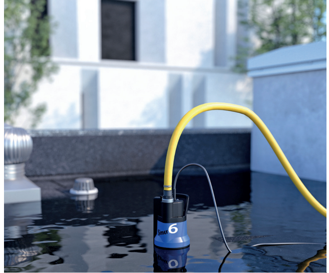
Rainwater can be quickly removed from flat roofs