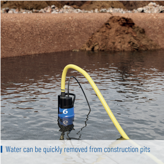
Water can be quickly removed from construction pits